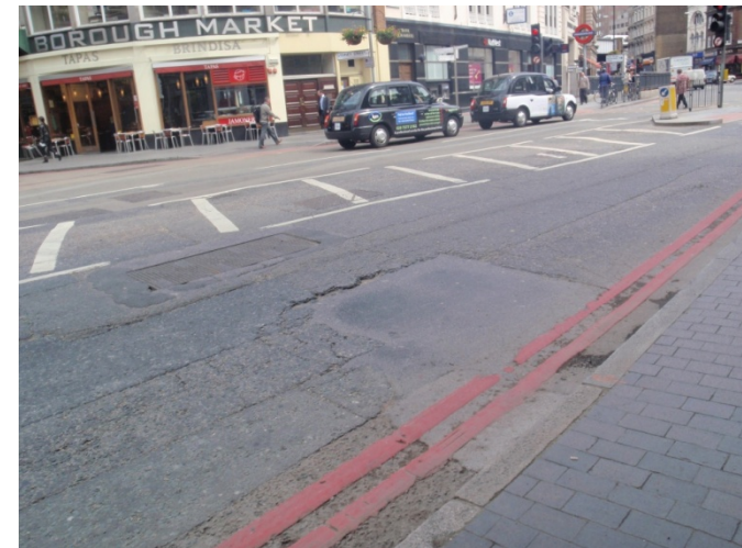
Utility patch failure